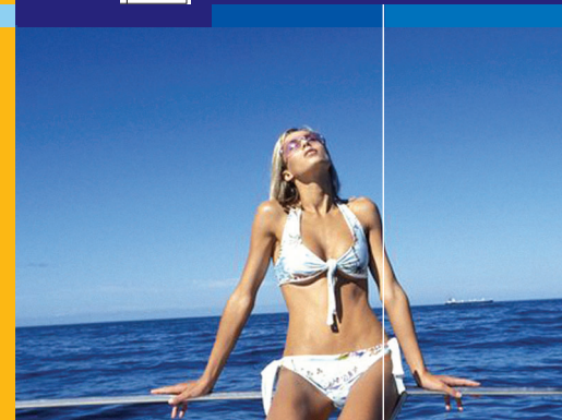
Ports of Call: Maritime Careers

So you've probably imagined yourself standing at the helm of a sea-going vessel. Maybe you're already an avid boater, maybe not...just yet. Whatever the case, you'll want to pilot your craft filled with the confidence and knowledge that comes with having your Captain's License. And you'll not only command the respect of the maritime community, you'll also be equipped with the skills to carry passengers and journey to the destination of your choosing—and even to make your living on the water. No matter what your intentions, adventure and challenge await. And the perfect place to launch your personal voyage is at Nautical School.